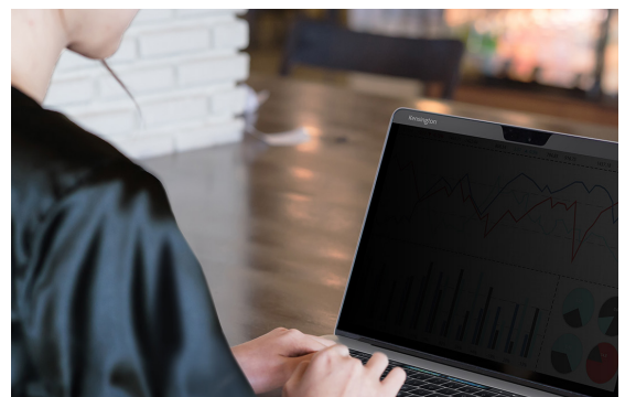
MacBook 12" Privacy Screen K52900WW

For more than 35 years, Kensington has been the brand IT professionals choose when they need the most innovative and reliable security solutions, desktop productivity accessories, and ergonomic products to deploy into their workforce. IT business professionals can rest assured every product has been designed with high-quality components that exceed industry testing standards, so it's built to last and will work safely with your deployed devices.