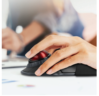
Detachable Wrist Rest

Delivers precise cursor movement for superior accuracy, so you can get where you want on the screen quickly with less hand movement, improving productivity and efficiency.