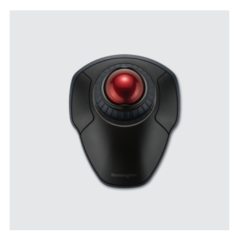
Optical Tracking Technology

Free downloadable software provides a personalized experience, giving you the ability to assign a variety of functions (including shortcuts) to the buttons, and adjust cursor and scrolling speed.