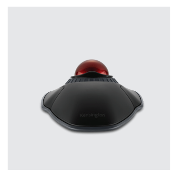
Ambidextrous Design Works equally well for right-handed and lefthanded users. Trackball reduces wrist and hand movement to ease repetitive-stress injuries.