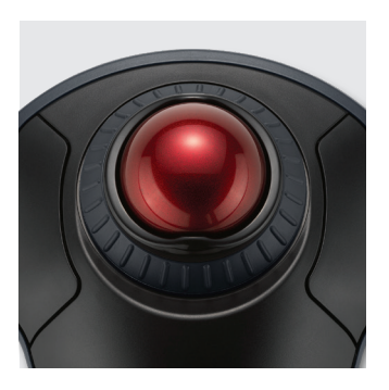
Scroll Ring and Medium Ball Spin the dial to move up and down web pages or documents with complete ease. The 40mm ball's hard surface is specially designed as a perfect sphere for precise tracking and control.