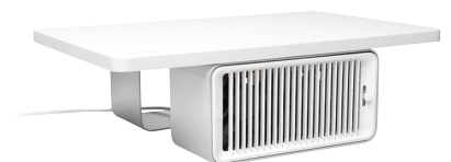
CoolView™ Wellness Monitor Stand with Desk Fan K55855WW

Research confirms that an optimally designed workstation provides wellness and productivity benefits that link proper posture to improved work attendance and a comfortable office temperature to increased employee activity. Improving posture, supporting correct eye positioning and promoting a comfortable office temperature, are just a few ways the CoolView Wellness Monitor Stand with Desk Fan supports employee wellbeing.