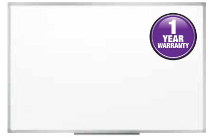
Economy Melamine Whiteboard