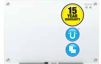
Infinity™ Glass Magnetic Dry Erase Board *Frosted glass is non-magnetic