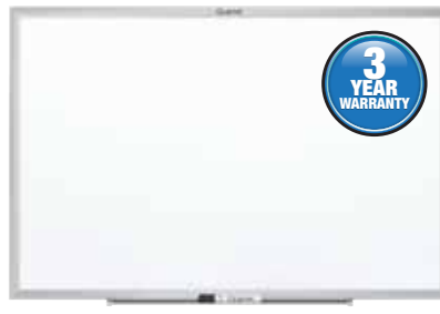
Classic Series Melamine Whiteboard