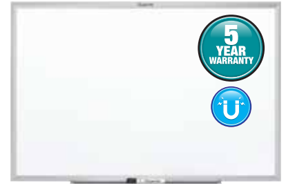
Classic Series Magnetic Whiteboard