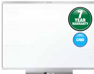
Prestige® 2 Total Erase® Whiteboard