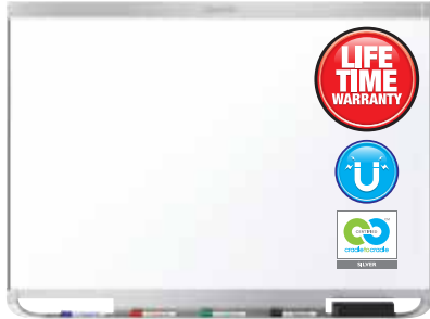
Prestige® 2 Porcelain Magnetic Whiteboard