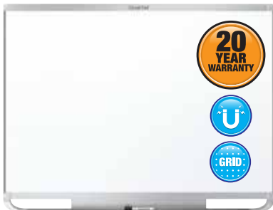
Prestige® 2 Magnetic Total Erase® Whiteboard