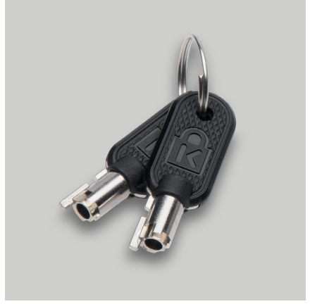
5mm Keying System

Attaches to the Kensington NanoSaver® Security Slot found in select ultra-thin laptops and tablets for uncompromised security.