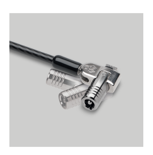
Pivot and Rotate Cable

Expanding side "hooks" grab the internal sides of the lock slot, creating a strong connection between the device frame and the lock to resist and deter theft.