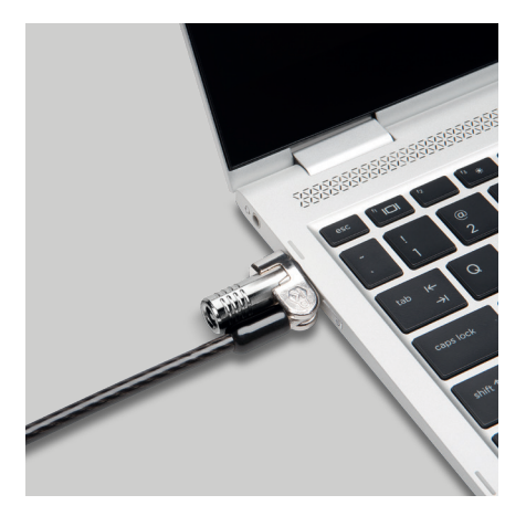
Tough 10mm Lock Head with Cleat™ Locking Technology

Part Number: K64444WW | UPC Code: 0 85896 60600 0