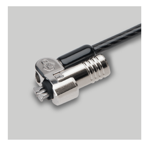
Unique Lock Engagement

Is compatible across all of Kensington's latest locks and includes patented antipick Hidden Pin™ Technology, all part of our robust custom key management solutions that include Master Keyed (K64445M), Single Keyed (K64445S) and Like Keyed (K64445L) options.