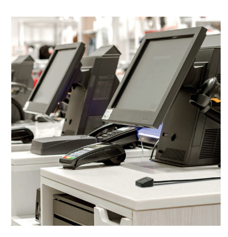
Hello for Business

Combines superior biometric performance and 360° readability with anti-spoofing technology, while exceeding industry standards for false rejection rate (FRR 2%) and false acceptance rate (FAR 0.001%).