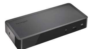
SD4700P Universal USB-C and USB 3.0 Docking Station K38240EU