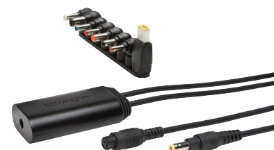
60W USB 3.0 Power Splitter for SD4700P K38310EU

1. USB-C host device must support Power Delivery. Power Delivery is not supported on USB 3.0 host devices without the use of the 60W Power Splitter (K38310EU) sold separately.