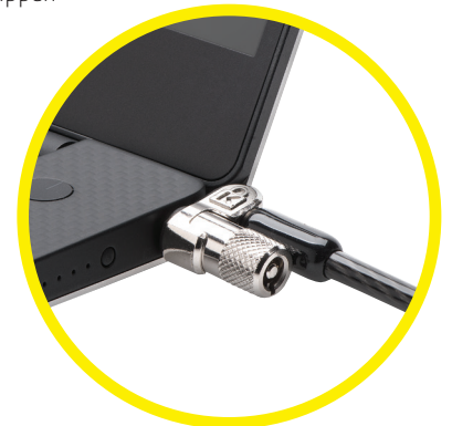
MicroSaver® 2.0 Keyed Laptop Lock K65020WW – $49.99