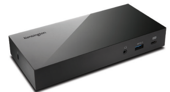
SD4800P Universal USB-C Scalable Video Dock with Power Delivery K38249EU

For over 35 years, Kensington has been The Professionals' Choice for desktop productivity solutions. Committed to delivering robust solutions, Kensington delivers high-tech productivity with universal simplicity.