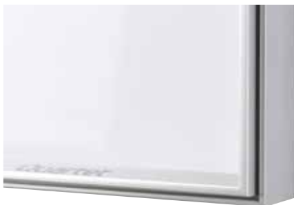
New Frame Design

Keeping in line with the creation of a progressive board surface, we have incorporated a clean, ultra-modern frame design. The board surface is recessed from the frame for a sleek and clean profile. The silver and black anodized aluminum frames look great in any workspace, including your most upscale conference room.